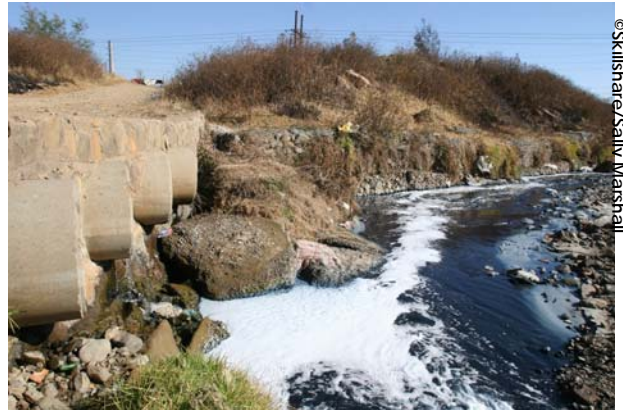
The polluted Blue River in Lesotho

In 2006-7, Skillshare International development worker Tracy Irvine worked with the Lesotho Council of NGOs to change public attitudes towards environmental degradation. A key concern during her placement was the toxic waste from textile factories pouring in to the Blue River - a vital source of drinking water.